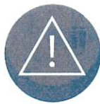
PANIC OR ANXIETY